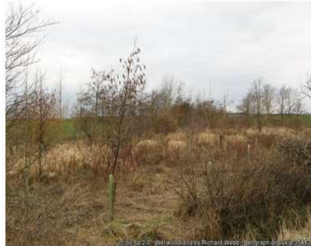
A triangle of damp land newly planted with alders.